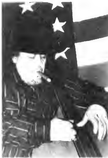
Photo of Charles Mingus